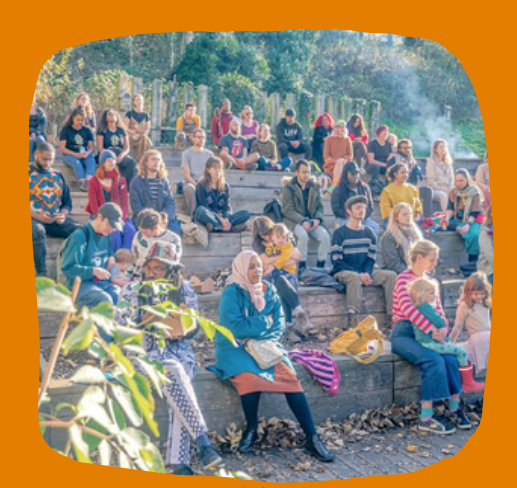
Boiling Wells Amphitheatre