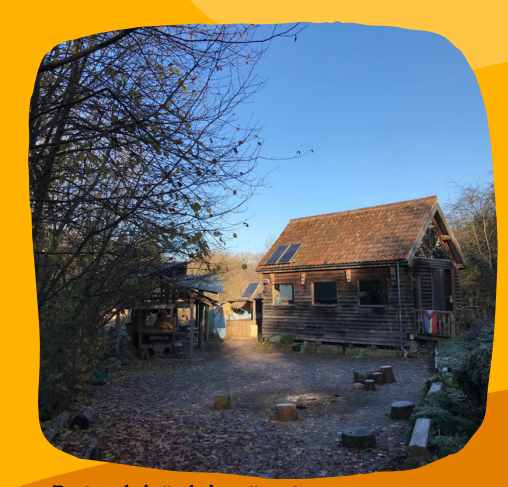
Boiling Wells Woodland

We have a range of spaces available to accommodate for a number of needs and activities. From classrooms, kitchens and meeting rooms to a Community Building and our magical Boiling Wells Woodland, with outdoor amphitheatre, roundhouse, outdoor kitchen, larch barn, cob pizza oven, fire circle, sculptures, paths and wildlife.